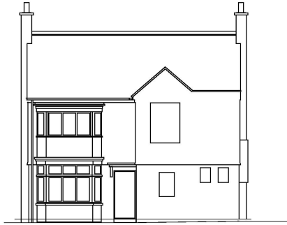
FRONT (North) ELEVATION - EXISTING

THIS DRAWING IS A PRELIMINARY DESIGN AND IS NOT TO BE USED FOR CONSTRUCTION OR FOR ANY OTHER PURPOSE WITHOUT THE WRITTEN AUTHORITY OF CEDAR STUDIO DESIGNS LIMITED.