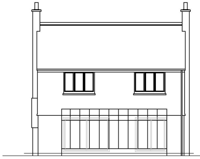
REAR (South) ELEVATION - EXISTING